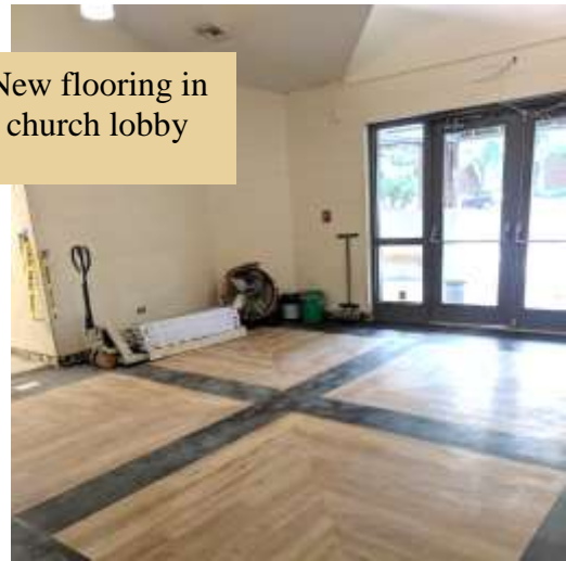
New flooring in church lobby