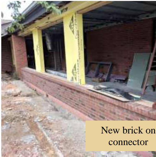
New brick on connector

Fresh Look Renovations are currently in full swing! Be sure to check room availability with the church office before scheduling your next meeting.