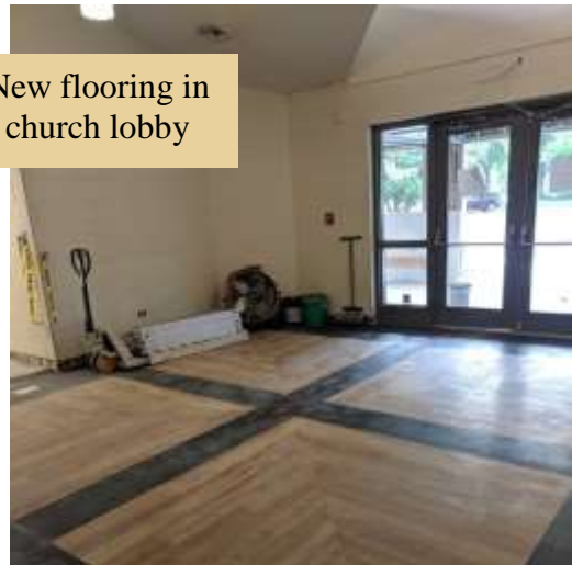
New flooring in church lobby