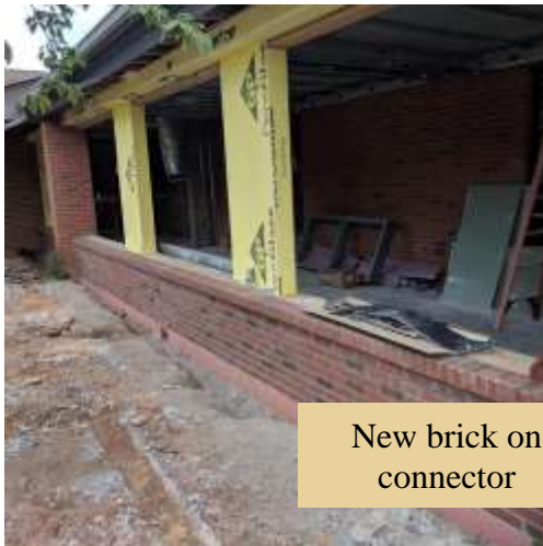
New brick on connector

Fresh Look Renovations are currently in full swing! Be sure to check room availability with the church office before scheduling your next meeting.