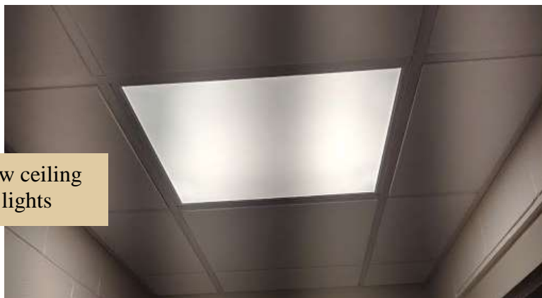
New ceiling lights