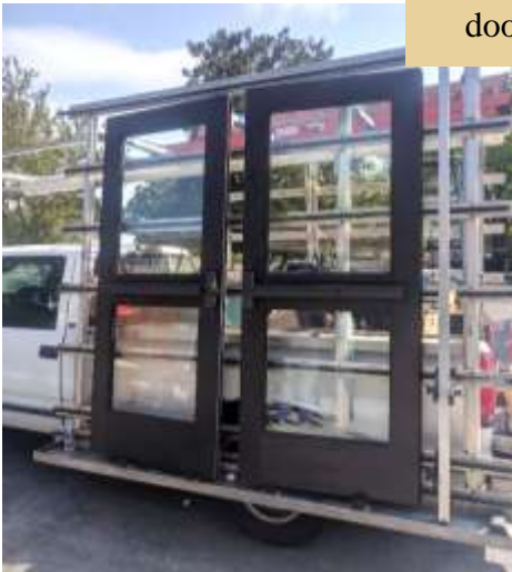
New Connector door arrives!

Fresh Look Renovations are currently in full swing! Be sure to check room availability with the church office before scheduling your next meeting.