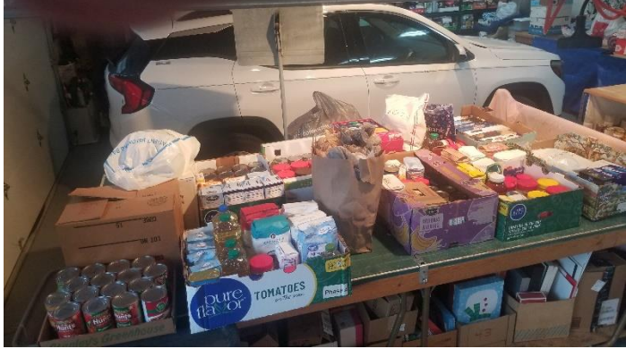
The Presbyterian Women would like to thank all of you who participated in restocking the food pantry at Sunset Gap this month. Your generosity will be invaluable to those in need. Thank you for your support.