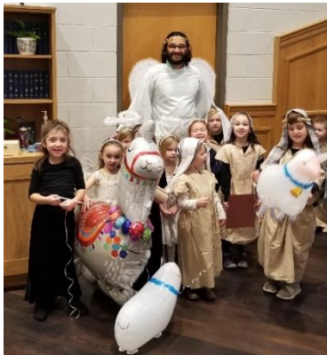
Christmas Pageant 2022