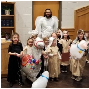
Christmas Pageant 2022

Our CHILDREN'S CHRISTMAS PAGEANT will be on Sunday, December 10 th during a single worship service at 10:00 a.m. We will have a Christmas Cookie Reception following worship that day. (A reminder to our families, that the children will have a rehearsal for the pageant on Saturday, December 9 th at 3pm in the sanctuary.) Make sure you plan to attend this special Advent program! We encourage congregants to bring your favorite Christmas cookies to share for the Cookie Reception following the program.