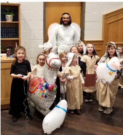
Christmas Pageant 2022

SAVE THE DATE! Our CHILDREN'S CHRISTMAS PAGEANT will be on Sunday, December 10 th during a single worship service at 10:00 a.m. We will have a Christmas Cookie Reception following worship that day. (A reminder to our families that the children will have a rehearsal on Saturday, December 9 th at 3pm in the sanctuary.) Make sure you plan to attend this special Advent program!