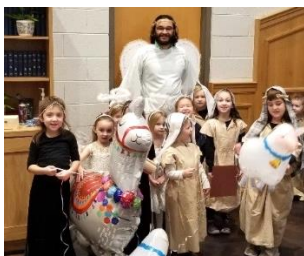
Christmas Pageant 2022

Our CHILDREN'S CHRISTMAS PAGEANT will be on Sunday, December 10 th during a single worship service at 10:00 a.m. We will have a Christmas Cookie Reception following worship that day. (A reminder to our families that the children will have a rehearsal on Saturday, December 9 th at 3pm in the sanctuary.) Make sure you plan to attend this special Advent program! We encourage congregants to bring your favorite Christmas cookies to share for the Cookie Reception following the program.