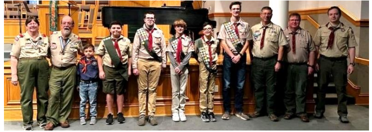
Scout Sunday 2023

Today is SCOUT SUNDAY! Some of the members of our church-sponsored Cub Scout Pack and Boy Scout Troop #444 will be assisting in worship today. Both scout groups are active and keep a schedule that includes numerous outings throughout the year, including camping, hiking, mountain biking, caving, rappelling, whitewater rafting, canoeing, pioneering activities and so much more. These activities provide an opportunity for scouts to work on advancement requirements and to have fun. Despite being so busy, these scouts find the time to spread landscaping mulch around our church each spring while preparing for their annual spaghetti dinner fundraiser in Fellowship Hall...this year the dinner falls on March 23 rd . Save that date and plan on having a delicious spaghetti dinner in support of these terrific young men..