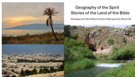
Geography of the Spirit Stories of the Land of the Bible Mondays at 5:30 in Room A from February 9 to March 30