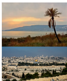
Geography of the Spirit Stories of the Land of the Bible Mondays at 5:30 in Room A from February 9 to March 30